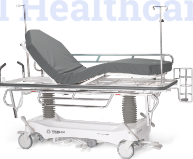
PATIENT TRANSPORT STRETCHERS - TECHLEM MEDICAL - CUSTOMIZABLE - MADE IN CANADA

SKU: CTBL501B Add to Cart Buy Now Price: Login to see prices