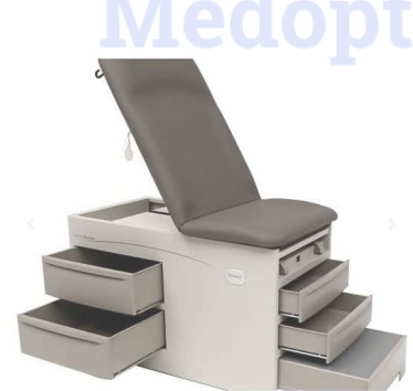
ACCESS® 5000 EXAM TABLE WITH PNEUMATIC BACK BLK SATIN ACCESS - EACH - BRW5000-24

SKU: BRW5000-24 Add to Cart Buy Now Price: Login to see prices