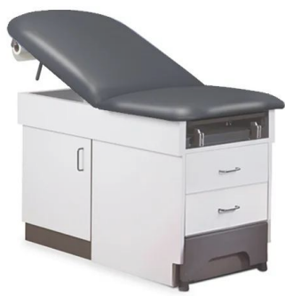
CLINTON FAMILY PRACTICE TABLE (EXAM TABLE) WITH STEP STOOL - WITH BLACK UPHOLSTERY - MODEL #8890-1GR-3BK

SKU: BRW5000-24 Add to Cart Buy Now Price: Login to see prices