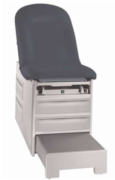
EXAM TABLE, WITH PELVIC TILT AND DRAWER WARMER BLACK 500LB 1EA - CTBL501B

SKU: 8890-1GR-3BK Add to Cart Buy Now Price: Login to see prices