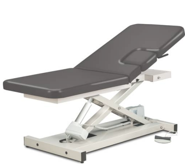
CLINTON OPEN BASE, POWER IMAGING TABLE WITH WINDOW DROP (ECHO) AND ADJUSTABLE BACKREST - BLACK COLOR - MODEL #85200 - CL85200-3BK