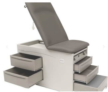
ACCESS® 5000 EXAM TABLE WITH PNEUMATIC BACK BLK SATIN ACCESS - EACH - BRW5000-24

SKU: BRW5000-24 Add to Cart Buy Now Price: Login to see prices