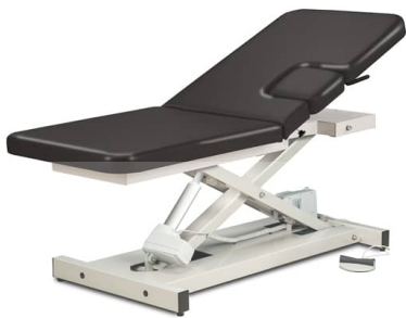
CLINTON OPEN BASE, POWER IMAGING TABLE WITH WINDOW DROP (ECHO) AND ADJUSTABLE BACKREST - BLACK COLOR - MODEL #85200 - CL85200-3BK

SKU: 8890-1GR-3BK Add to Cart Buy Now Price: Login to see prices