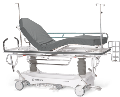
PATIENT TRANSPORT STRETCHERS - TECHLEM MEDICAL - CUSTOMIZABLE - MADE IN CANADA