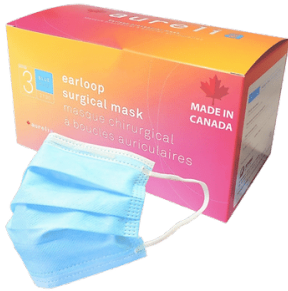
SURGICAL FACE MASKS - WITH EARLOOP - (ADULTS) – ASTM LEVELS 3 - 50/BOX (BLUE, BLACK, PINK)