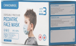
SURGICAL FACE MASKS - PEDIATRICS - ASTM LEVEL 3 - 50/BOX - CMSQ4054

SKU: N/A Add to Cart Buy Now Price: Login to see prices