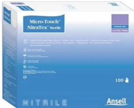
MICRO-TOUCH® NITRA-TEX® EXAMINATION GLOVE - STERILE - NITRILE - BLUE - 50 PAIRS/BOX

SKU: N/A Add to Cart Buy Now Price: Login to see prices