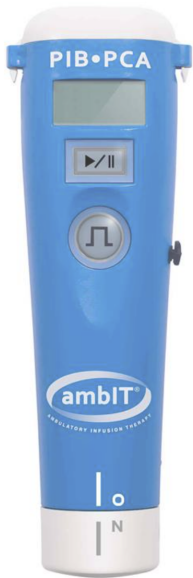
AMBIT – ELECTRONIC PAIN CONTROL – EACH