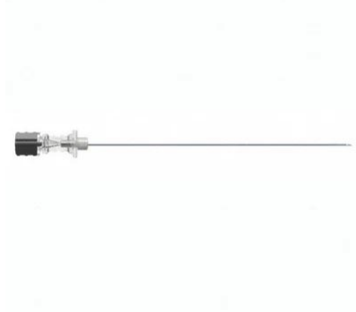
SPINOCAN QUINCKE SPINAL NEEDLE – QUINCKE BEVEL – CASE – 50/CASE